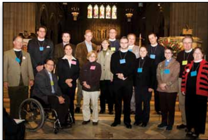
Clergy new to the diocese, clergy in new positions, seminarians, and deacon postulants.

“I loved it! I had doubts that we could get all of the business [of Convention] done in one day, but I must say that the bishop moved the Convention along in a wonderfully orderly manner.”