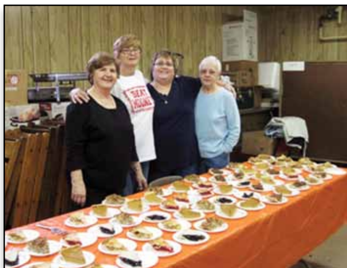
Steubenville parishioners serving dessert at the Good Shepherd Lunch in East Liverpool.