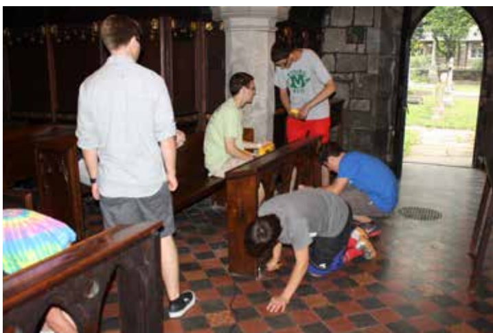
Removing pews from the church at St. Paul's Episcopal School in Philadelphia