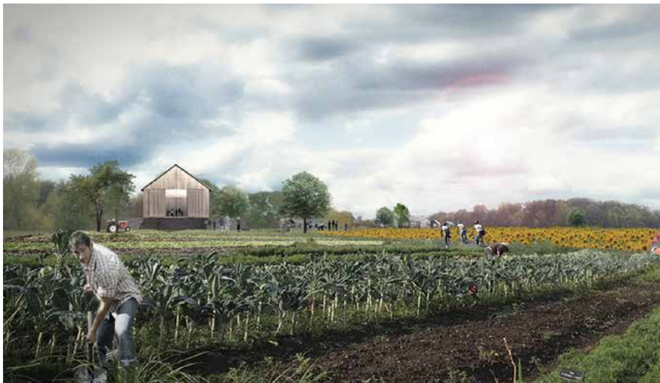
> A concept drawing of farm fields for the proposed camp and retreat center