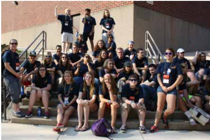
24 youth and 6 adults from the Diocese of Ohio participated in EYE14