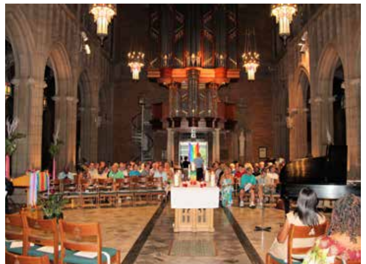
The Gay Games Interfaith Service at Trinity Cathedral featured the participation of local, national and international faith leaders