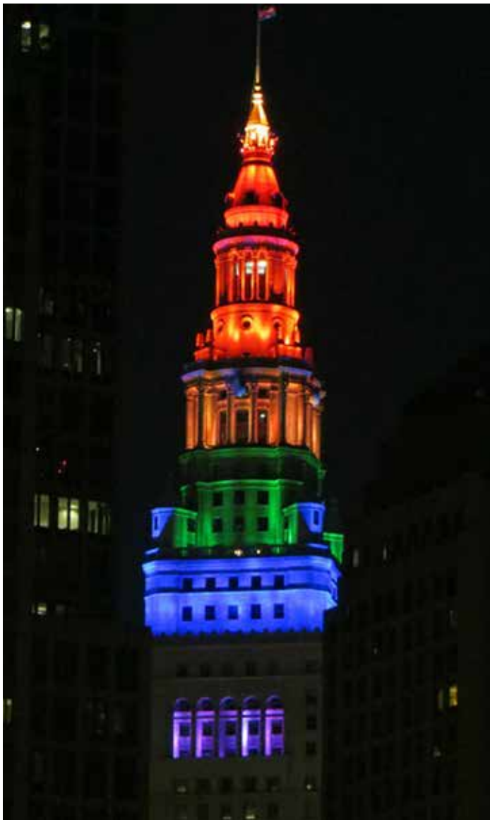
The Terminal Tower in Cleveland was lit in rainbow colors for the Gay Games