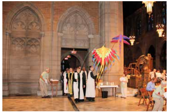
The procession at the Gay Games Interfaith Service