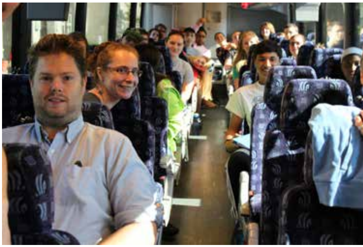
Youth and adults departed Cleveland by bus