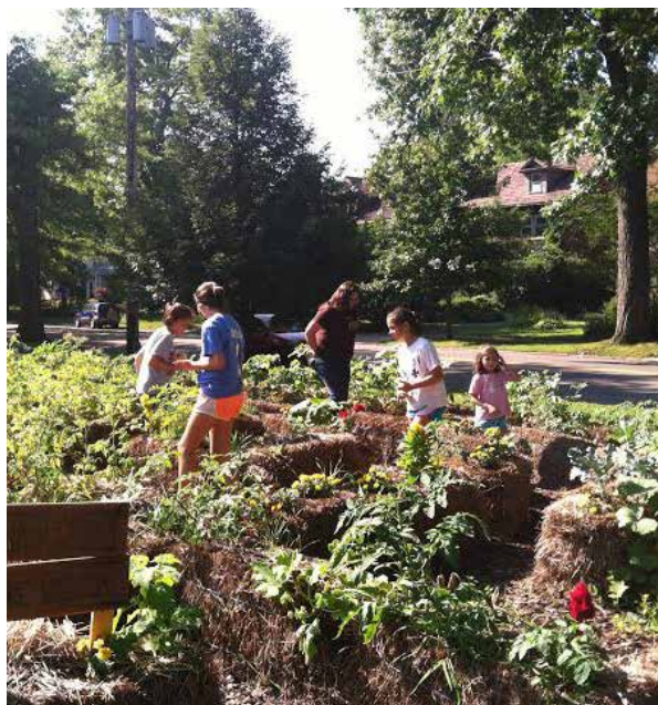
> The labyrinth garden