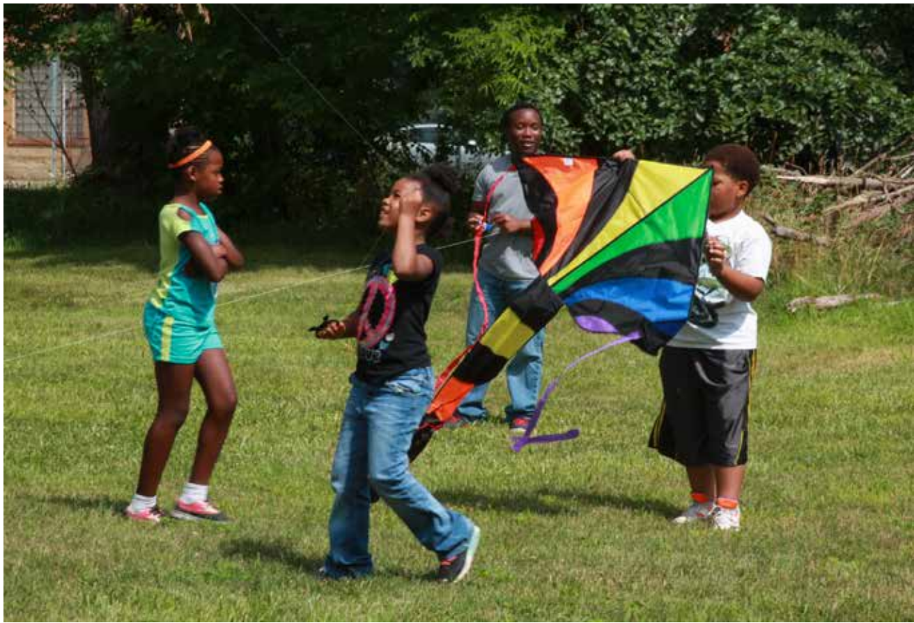
> Children enjoy many activities during the summer camp

for different types, I could never get her to try kale before, but now she loves it.” McBee said.