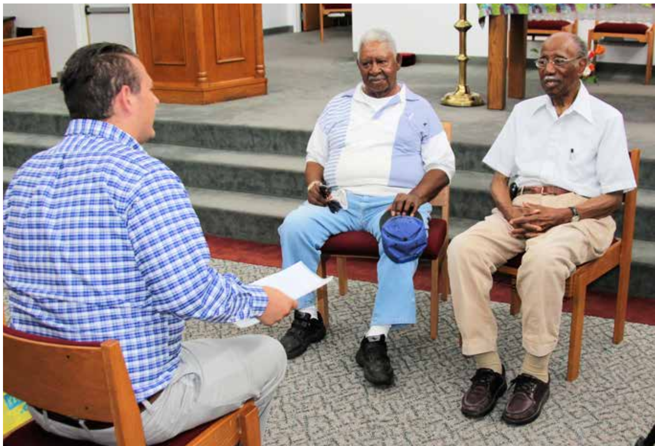
> Interviewing two senior saints from All Saints, Toledo