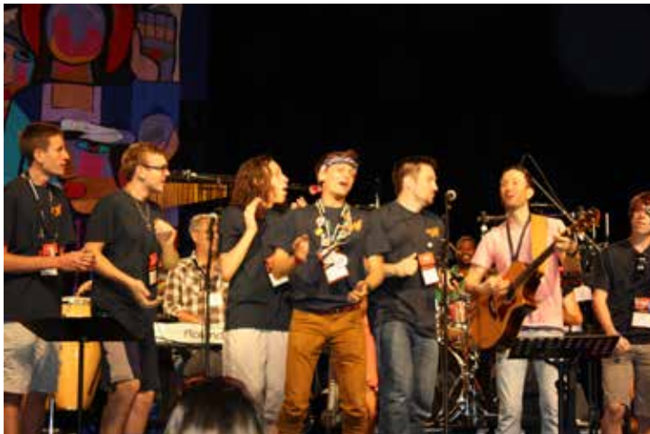
Singing with the band, Live Hymnal