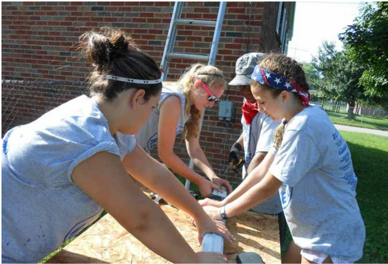
> Missionaries from All Saints, Parma, and St. Peter's, Lakewood work on home repairs

group activities helped the missionaries to become acquainted with one another. On Sunday night, and on the following four nights, they slept in cozy cabins, most of which sat atop a treacherously steep hill.