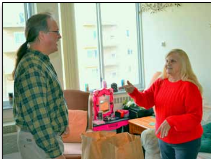
A delivery at the Educator.