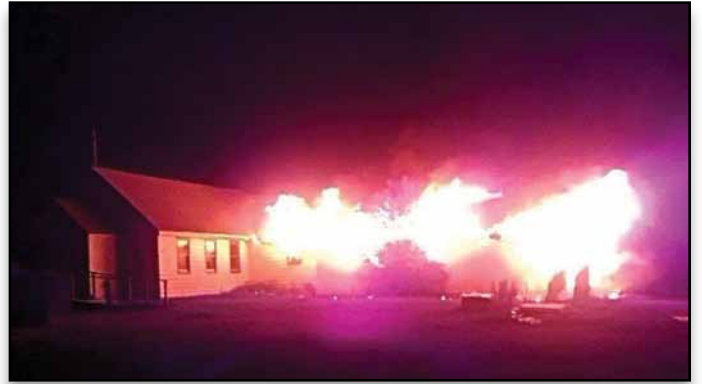
The fire that burned down St. James Church in the Episcopal Diocese of North Dakota.