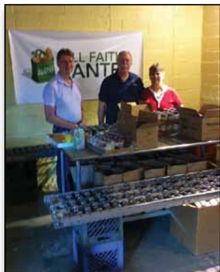
All Saints' packing team.