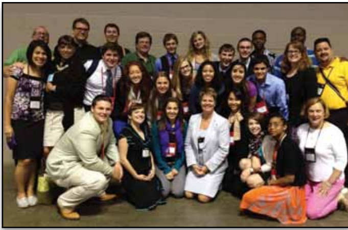
Young Adult Festival attendees at General Convention.

delve into a process of exploration and discernment.”