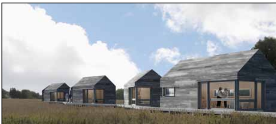
Proposed cabins offer meditative views