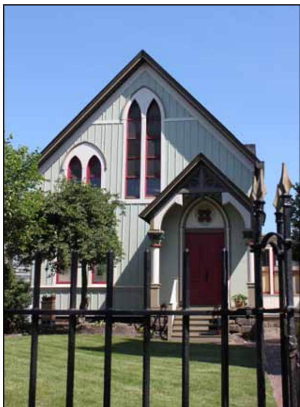
St. John's Church Parish Hall

All these things are great, but they are happening almost everywhere, and our cities are competitive by nature. Every city has cool bars, many have museums, plenty have their niche in the job market, and every city has some semblance of neighborhoods. It is time we spoke honestly about Cleveland. It is the people that make this a great city and everything else is a derivative of what Clevelanders have done, are doing, and will do. Cleveland is a city of vocation.