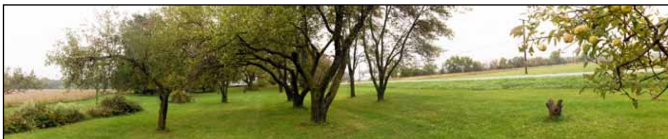
A small apple orchard exists along State Route 60 near the existing farmhouse