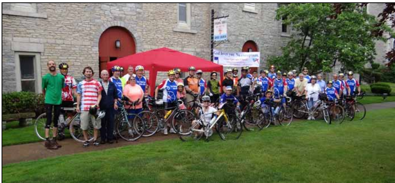
A group photo in front of Grace, Sandusky, before the day's start to the ride

This summer is the year I discovered how big the church could really be, and it has hit home in a very personal way. In my fourth year with the bike ride, I have a good idea of how to organize the event. Like the church can sometimes be, I've gotten set in my ways. In my head, I know what works, and what doesn't. I know what has been accomplished, what's been a bust, and how to keep everyone safe.