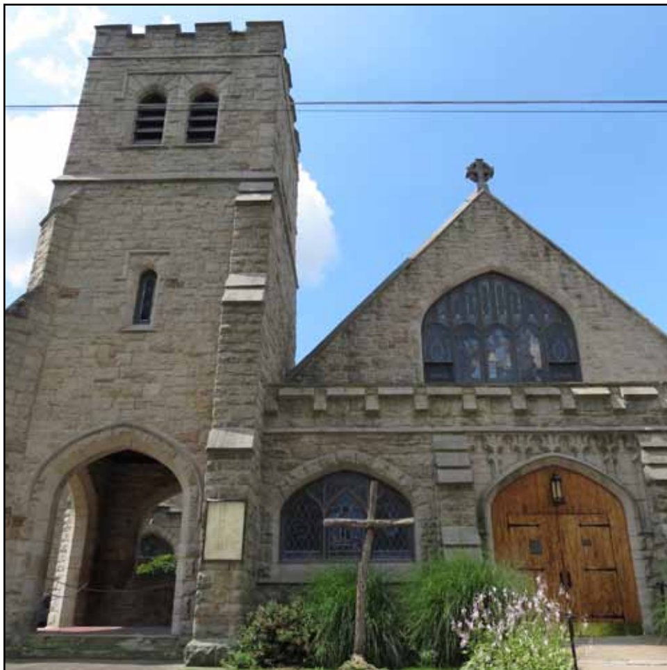
St. Stephen's, built of stone in 1900, remains a fixture of downtown East Liverpool.