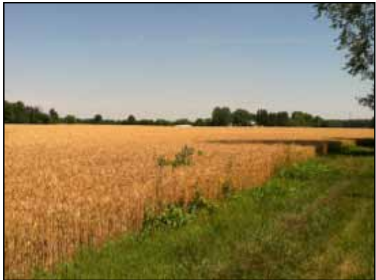
Part of the existing farm site

community development,” as stated on the organization’s website.