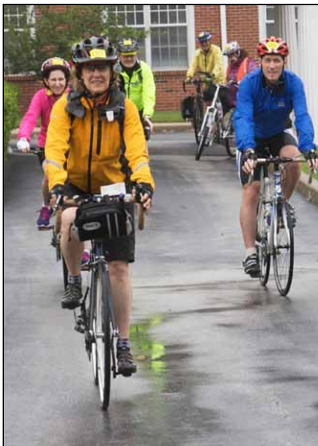
A rainy day for a ride

I have learned many lessons about being the church in the seven years I've worked on the Bishop's staff for the Diocese of Ohio—most of them good, a few discouraging, but none more unexpected than what I have learned from the Bishop's Bike Ride. I picked up ownership of the event in its fourth year, not because it belongs in the Office of Communications, but because after reading the blogs of the eight people who rode cross-country in 2009 from Anaheim to New York, my imagination was captured by the sheer accomplishment of their trip and the inspired writing of one of the cyclists who published a blog in such a “you-are-there” style that I felt as if I were enduring the heat of the desert, climbing the Rocky Mountains, and battling the winds of the Great Plains right along with him. The story was published in ChurchLife (Fall 2009).