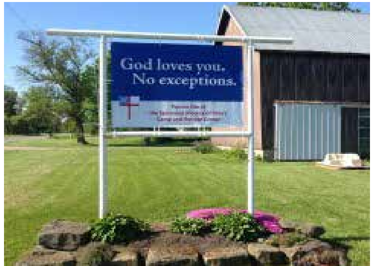
New sign welcomes guests to the Wakeman site