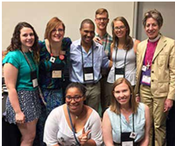
Young Adults from the Diocese of Ohio with the Presiding Bishop Katharine Jefferts Schori

I went to convention expecting to gain a deeper understanding of church polity, and although I expected to have the opportunity to network with other congregations and dioceses, I did not expect to leave with a group of people whom I consider part of my family—a group of friends bound by their faith and love for The Episcopal Church.