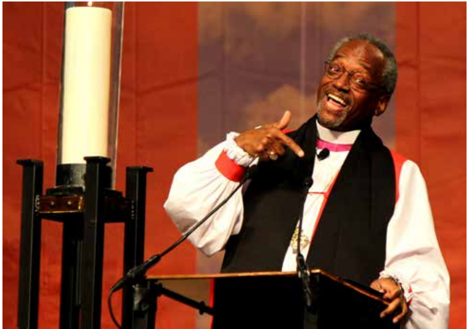
Presiding Bishop-Elect Michael Curry preaches at General Convention