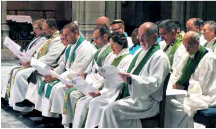
Diocesan clergy during the Eucharistic celebration

imagining; and it is confidence that we ourselves are capable of laboring successfully in that harvest, not because of who we are, but because of who God is. Hear the words of Isaiah read this evening, “It was no messenger or angel but his presence that saved them; in his love and in his pity he redeemed them; he lifted them up and carried them...”