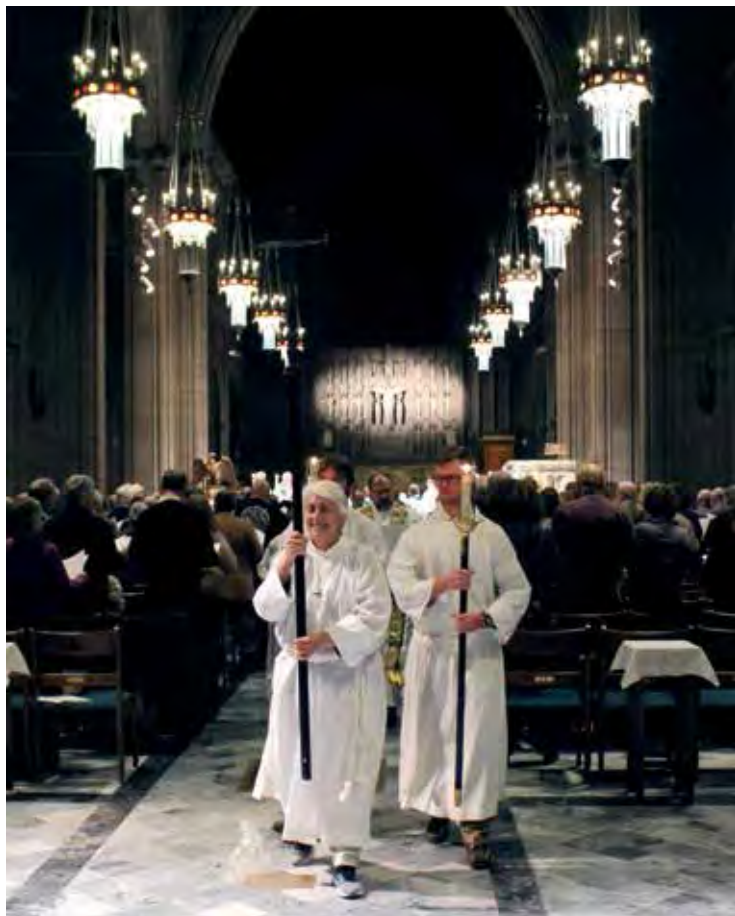
The processional at the Eucharist

Both scripture and our experience teach us that the answer is Yes. In fact, time and again, you and I find that we are made more whole, more complete, by those who are different from us. Ruth the Moabite. The Samaritan traveler. Strangers who change us. By engaging with the stranger on an honest level, we are changed. And in offering ourselves as a stranger, as Ruth and the Samaritan did, with a willingness to engage generously, honestly, and humbly with those whose experience and reality are different from ours, the world is changed. Love God. Love your neighbor. Change the world. The enemy wants us to believe that difference is dangerous. It wants our response to difference to be fear. But "the good news of the kingdom" that Jesus proclaimed in all the cities and villages is that difference is a blessing. Our capacity to embrace difference as blessing is what makes us godly.