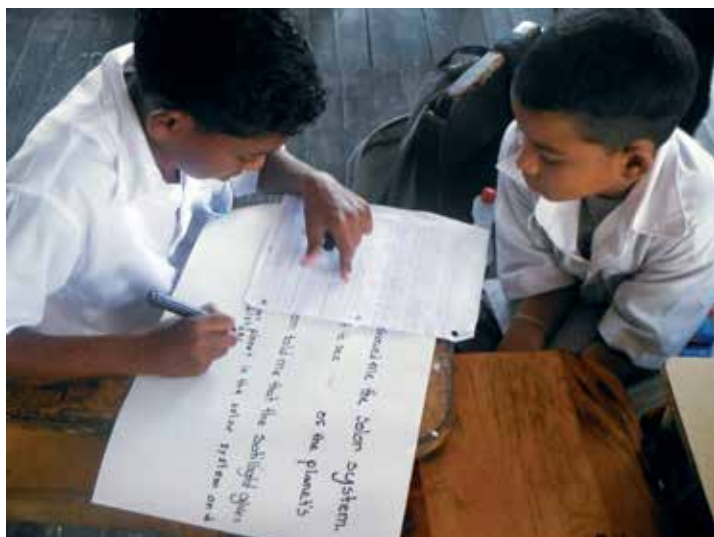
Students at the Anglican School in Belize