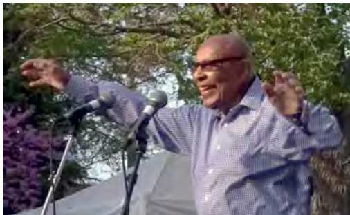
Retired Congressman Louis Stokes helps dedicate the marker for the Underground Railroad in May

On the programming side, we have lived well into our partnership with the Cleveland Public Theater, presenting the Student Theater Enrichment Program show in July, a November show from Y-Haven, a recovery program for homeless men, and an even larger and more inspiring Station Hope event in May, where Louis Stokes helped us dedicate our Underground Railroad marker. We were able to combine the Y-Haven Show (which features a new play written by men in recovery) with a real “first”: the show and sale of art