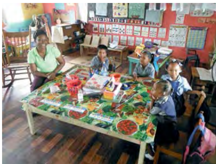
Students and teacher in their classroom in Belize

For more information or to support the program, please contact Matt Teare at matteach@windstream.net . †