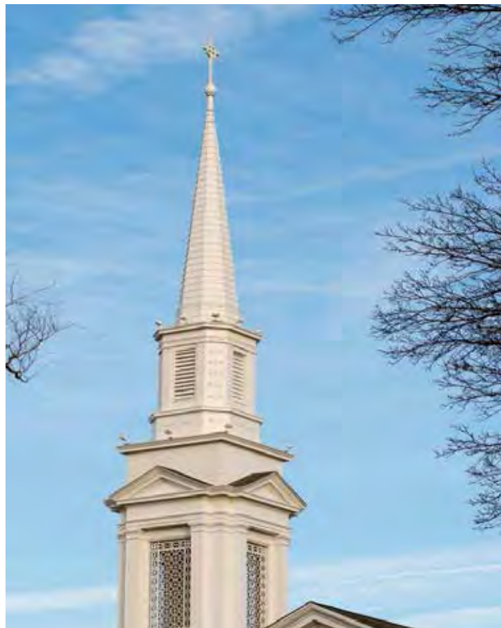
White Spire, Christ Church, Shaker Heights

The Church began the approximately $350,000 Phase I renovations this fall tackling sorely needed deferred maintenance on the building infrastructure.