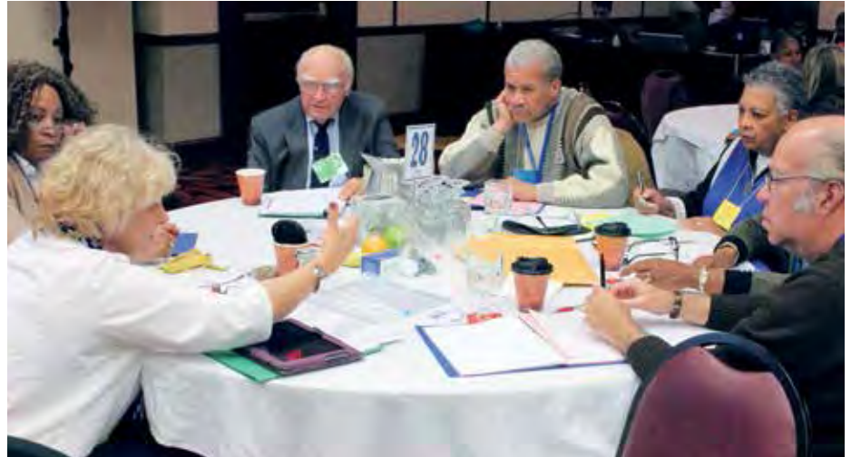
Racial reconciliation was the topic for table discussion at this year's convention (above right)