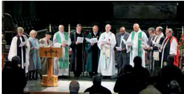
Celebrating Interfaith Thanksgiving at Trinity Cathedral