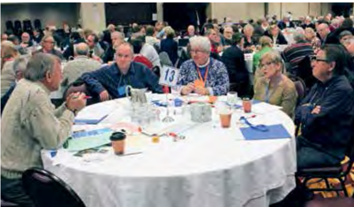
Convention attendees participating in table discussions

Delegates and guests were then invited to participate in a table discussion around expectations and hopes for the CRU and