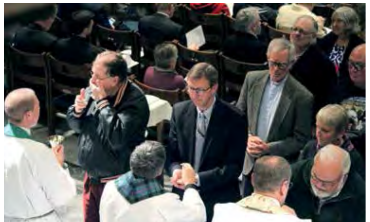
Congregants receiving Communion