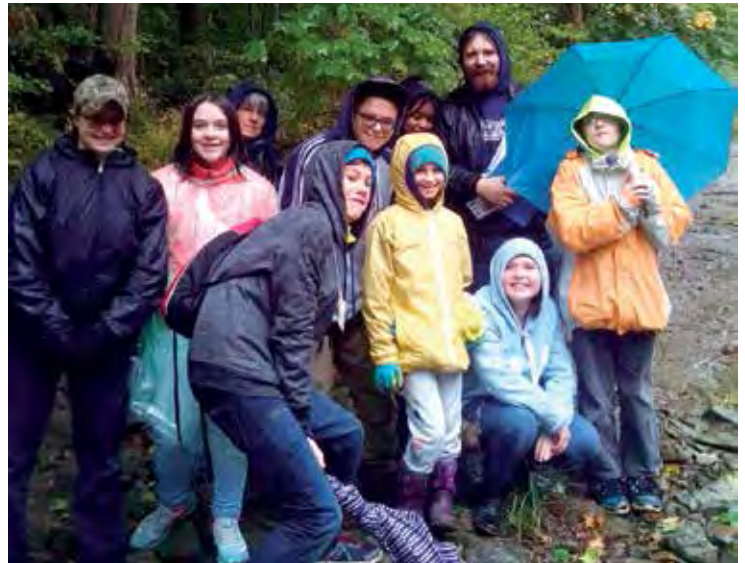
Diocesan youth exploring the site of the new Camp and Conference Center despite the rain.

It was clear to see that all the participants were energized by the experience and bonded with each other. On the soggy trip home, they shared laughter and stories of their escapades. One young person shared, "I thought it would be hard to make friends since I was the only person from my church but people were really welcoming and friendly."