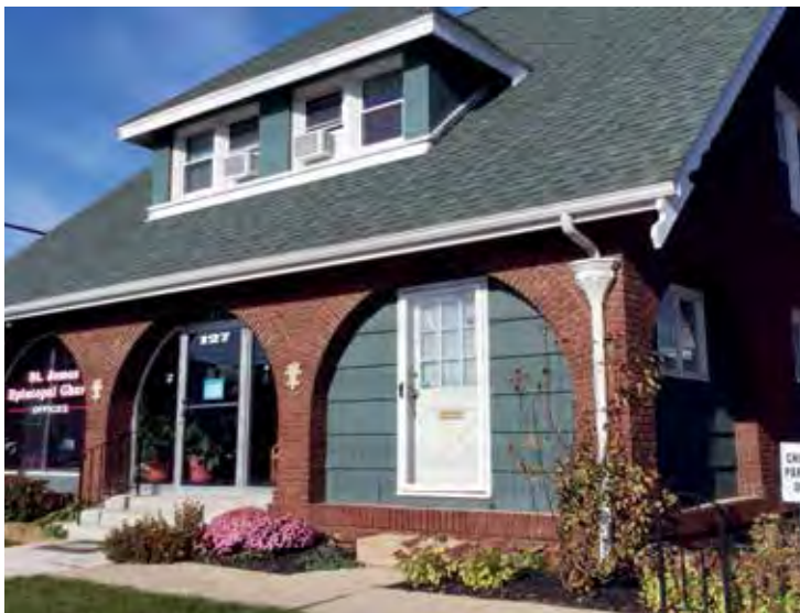
The new energy efficient windows in the office at St. James, Wooster

The church sits in the center of the Van Aken Redevelopment District, which is to become the new city “heart” of Shaker Heights. Shaker Heights Development Corporation (SHDC) is conducting a feasibility study for a potential capital campaign in the city to raise the funds for the repurposing. The 38% share from Christ Church capital funds is to enable the parish to participate in this project. The funds would be dedicated to new and upgraded restrooms, HVAC repairs and additions, new windows, electrical work and plumbing upgrades. Repurposing of the sanctuary to accommodate the fine arts of dance, theatre and music, as well as the mechanical support systems to sustain such an endeavor would be funded through the SHDC capital campaign. †