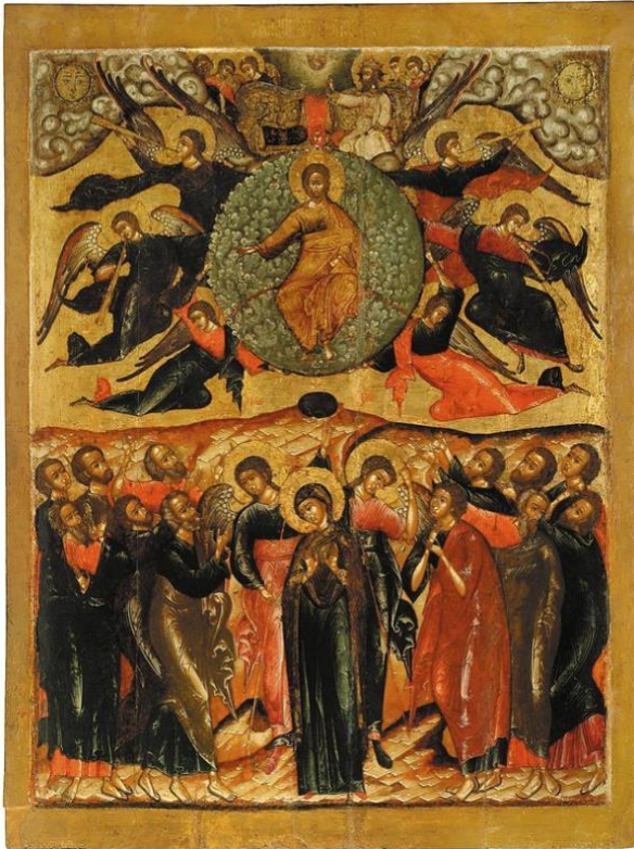
Ascension icon, mid-17 th century https://tmora.org/online-exhibitions/transcendent-art-icons-from-yaroslavl-russia/17th-century-icons/ascension/#jp-carousel-942