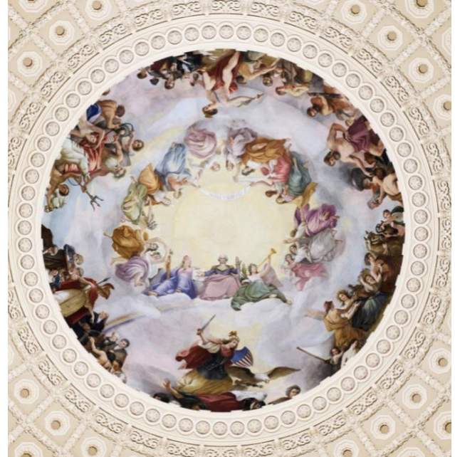
The Apotheosis of Washington, 1685 Constantino Brumidi, Capitol Rotunda, US Capitol Building, Washington, DC https://www.aoc.gov/explore-capitol-campus/art/apotheosis-washington

How does the iconography of our Capitol contribute to the “fus[ing] of the interests of the nation ... and the interests of God”?